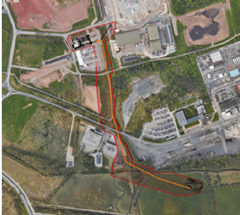
Red Line Boundary for the Protos (West AGI) Spur Pipeline

The engagement period for the Protos (West AGI) Carbon Dioxide Spur Pipeline Proposed Development has now closed, gathering valuable feedback from stakeholders on the Proposed Development.